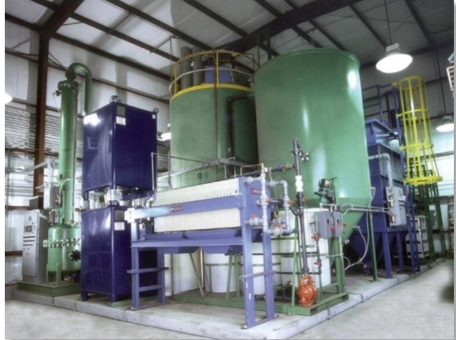
FBR system treating aniline- and nitrobenzene-contaminated wastewater in New Jersey. This technology has been certified by the State of New Jersey's DEP Innovative Environmental Technology Certification Program.

For a broad range of influent flow rates and contaminant concentration levels, our fluidized bed reactor (FBR) system is often the most economical treatment choice. With aerobic, anaerobic and anoxic designs available, systems have been successfully operated at ranges from 5 to 6,000 gallons per minute while simultaneously providing high performance at low capital and operating costs.