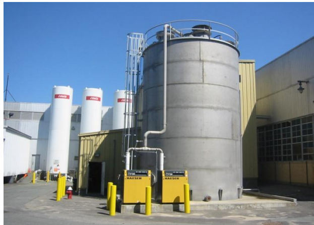
Bioreactor treating soft drink bottling plant wastewater

The MBR system offers an excellent solution for in-process, at-source treatment applications and can be used in very demanding applications, including streams not commonly considered amenable to biotreatment.