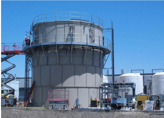
MBR system showing 30-foot diameter reactor with internal membranes.

Envirogen Technologies, Inc. offers a biological treatment system for aqueous wastes that produces exceptional water quality at low cost.