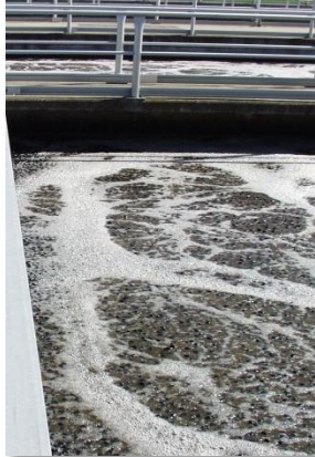
SCR system showing reactor