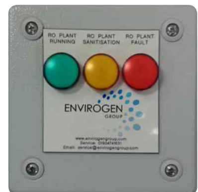
Remote wall-mounted alarm indicator