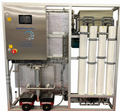
A duplex EndoTherm Duo XL RO system